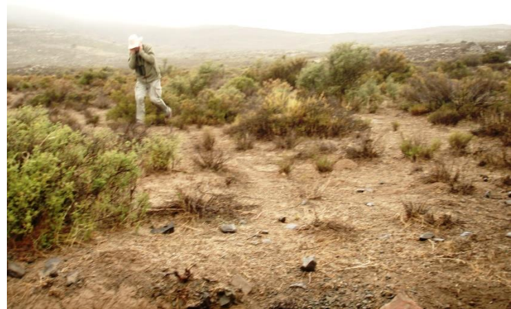
Figure 2 Simon breaks for cover in an unusual wet and windy Karoo