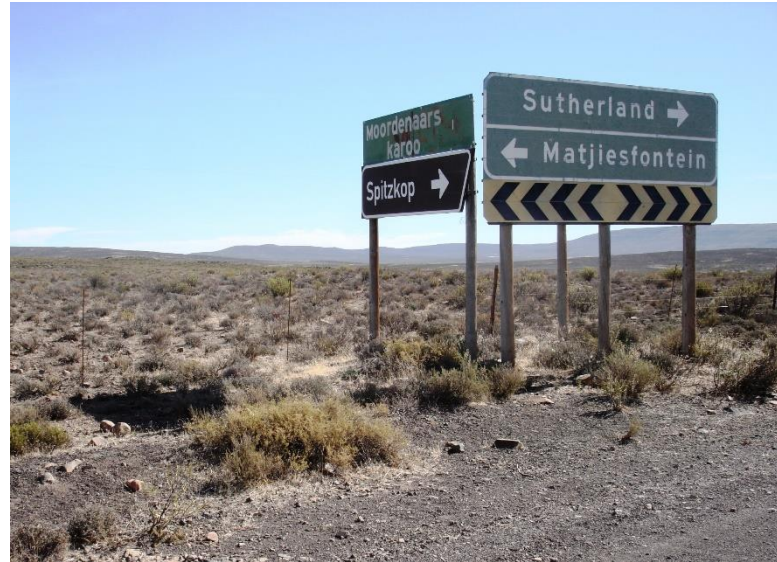
Figure 1 Fortunately, no murderers hang out there these days!

Tractrac Chat inhabits desert gravel plains.