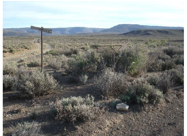
Figure 3 The scraggy habitats of the Moordenaars Karoo.

I began to wonder whether this is this some kind of record? Neither Simon nor I have ever experienced this before in all our atlasing days. When one visits the Karoo, the impression is generally one of a monotone habitat, often miles of scraggy drie-doring shrubs, distant koppies, rocky outcrops, some dry river courses. Pentad 3245_2040 had this, but clearly just a bit more to get all 7 Western Cape chat species! It just goes to show that one never does know what your atlasing will reveal!